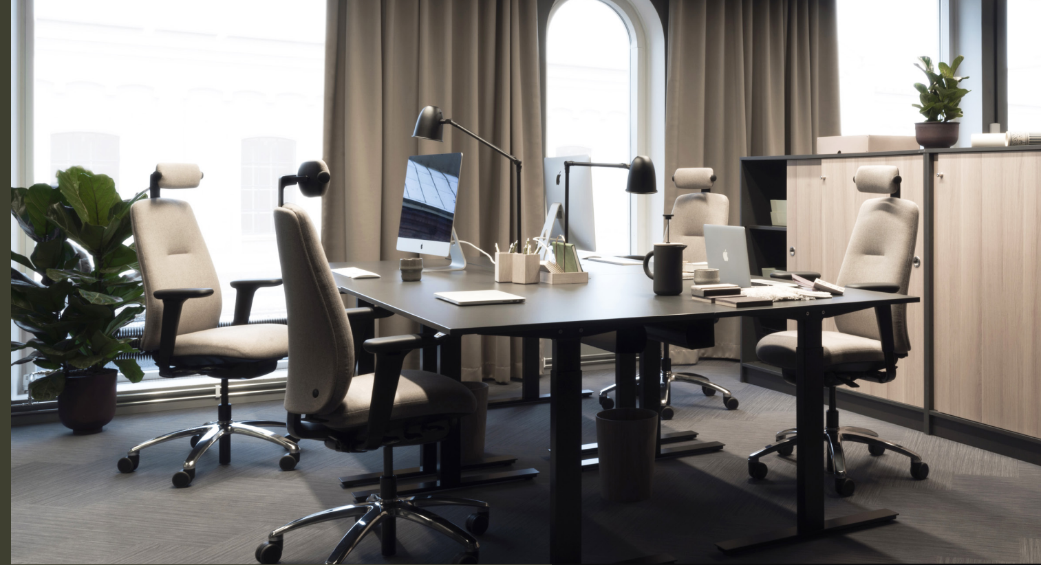
RH NEW LOGIC 220 with headrest and armrest